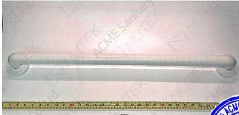
Figure 1 - Sample